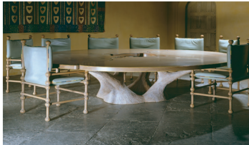
Liberty Table and Chairs

After 25 years as founder and director, Makepeace stepped down, the Trustees appointed a successor and Parnham House was sold. The Trust moved to a new campus at Hooke Park and amalgamated with the Architectural Association, where both ran world-renowned courses for architects and designers.