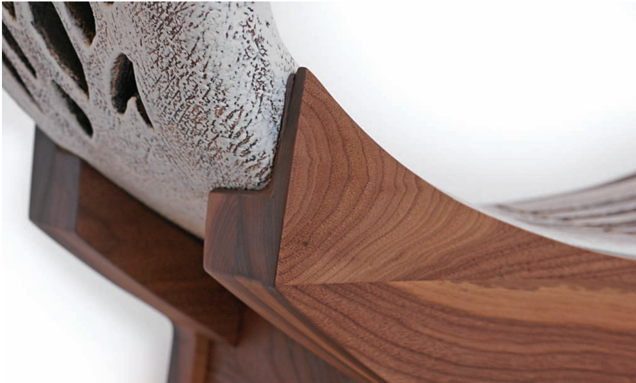
Image: Winged seat (detail) from In Tandem.