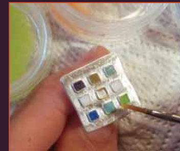
Applying the enamel, Zsuzsi Morrison