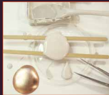
Coating copper shapes with liquid enamel