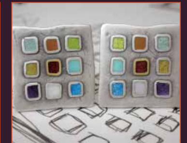
Final piece, Zsuzsi Morrison

Plique à jour meaning 'Light of day' or window enamel is the most fragile and exacting of enamelling techniques. In plique à jour work enamels are transparent or translucent and are fused across a design of cells of gold, silver or copper; a backless cloisonné. The object needs to be well lit to reveal its transparency and complex structure.