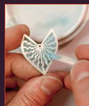
Second coating of enamel; then fired for a second time