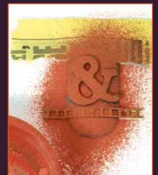
Sifting onto the stencils