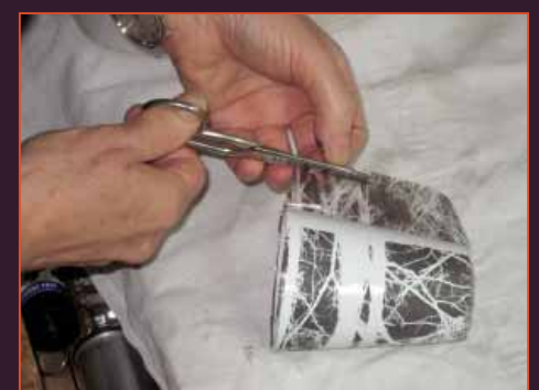
Applying transfer, Tamar De Vries Winter Treecups