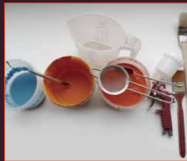
Wet process/Porcelain enamel – buckets ready for pouring, brushing or spraying, Elizabeth Turrell