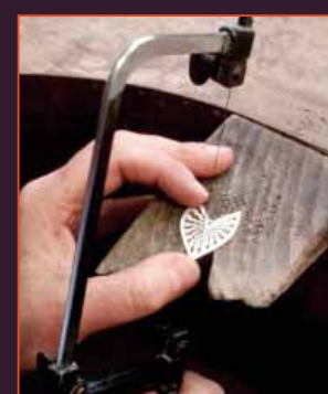
Piercing the shapes with a fine bladed jeweller's saw