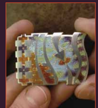
The finished piece

Cloisonné klwa-son-nay is French for 'cell'. Thin strips of metal (wire) are bent to make an outline of a pattern and traditionally they were attached to the metal base by soldering. Most contemporary enamellers fuse the wire into a previously fired coat of enamel; the cloisons (fenced-off forms) are then filled with powdered enamel and fired in several layers. The enamel is then ground level with an Alundum stone and/or emery paper, and then either polished to a sheen by hand, or refired until the enamel surface has glossed over.