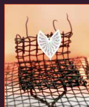
The piece is suspended on wire for firing