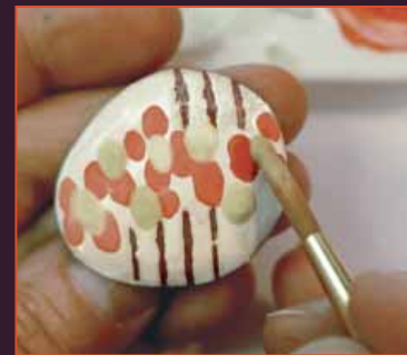
Painting with liquid enamel