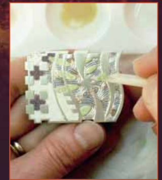
Applying the first coat of enamel