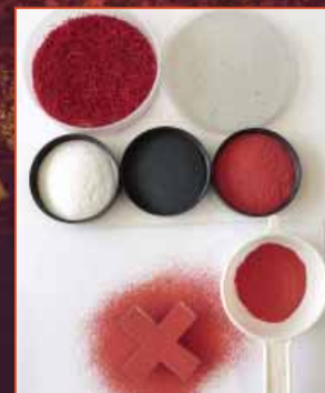
Top: Red enamel threads and reflective glass beads, middle: White, black and red sifting enamel, bottom: Sifting, Elizabeth Turrell

The enamel is sifted (dusted) through a hand held screen or sifter over the stencil, which is removed before firing. Stencils can also be carefully placed on dry wet process enamel to produce a drawn outline of the stencil or by scratching the enamel to remove the exposed area. The advantage of stencils is that they can be used to repeat an image as many times as required.