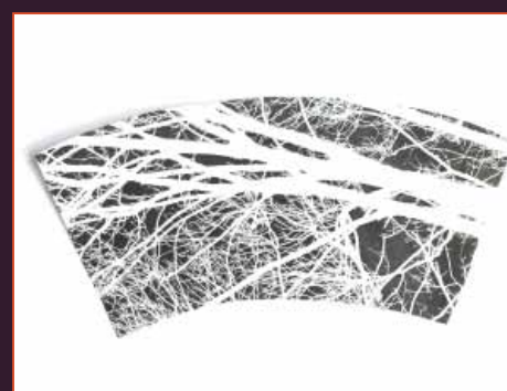
Transfer map, Tamar De Vries Winter Treecups

Transfers (also known as decals) are made by printing an image onto a thin flexible plastic carrier, which has a paper backing. The carrier is released when soaked in water and the image is floated onto the pre-enamelled piece; once the transfer has been positioned flat on the piece it can be dried and fired.