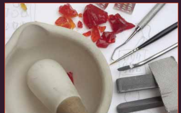
Enamelling tools, Zsuzsi Morrison