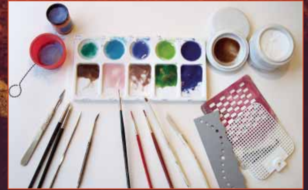
Equipment for applying enamel: sifter, brushes, stencilling items, enamel pots and pallet

There are many different techniques in the field of enamelling, all of which involve either creating relief pattern on the metal base layer and then enamelling on top, or creating pattern on top of an already-fired layer of enamel. The artists in this exhibition use a variety of techniques in a very free way: their concerns lie with the creative process.