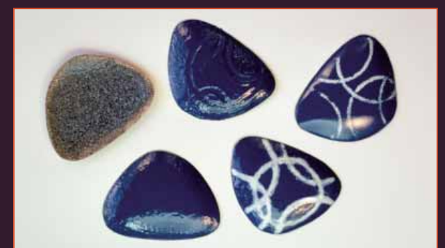
Different stages of sgraffito

Sgraffito is an Italian word meaning scratched. These incised marks are created by scratching away a drawing or design, exposing either the metal or a fired enamel coat beneath. This approach allows drawings of energy, spontaneity and great delicacy, especially if the drawing/mark-making is done through a dry coat of wet process enamel. This may be a purely linear decoration or larger areas may be scraped away. The surface can be built up in subsequent firings. This is primarily a ceramic technique and has been used for centuries.