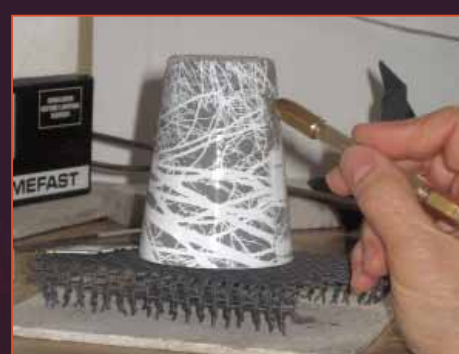
Firing transfer in kiln, Tamar De Vries Winter Treecups