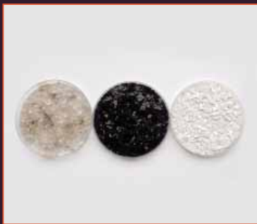
Industrial frit – clear, black and opaque frit for industrial enamels before grinding in a ball mill with other chemicals and oxides to make the industrial wet process enamel, Elizabeth Turrell

The enamel is prepared by grinding clay and various deflocculants (inorganic salts) together in a ball mill for several hours. The deflocculants act as suspension agents and keep the slush or slip enamel in a creamy consistency. As the enamel is dipped and sprayed it is usually ground finely enough to pass through a 200-250 mesh screen.