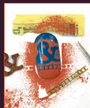
Finished piece before firing