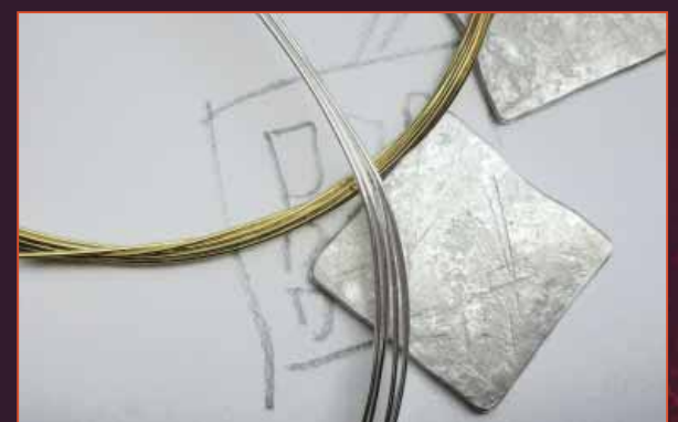
Silver and 22ct gold wire, Zsuzsi Morrison