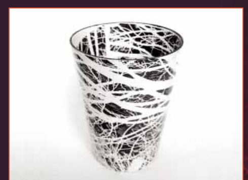
Finished piece, Tamar De Vries Winter Treecups