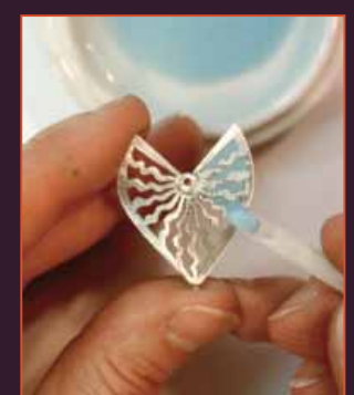
Filling the cells with enamels