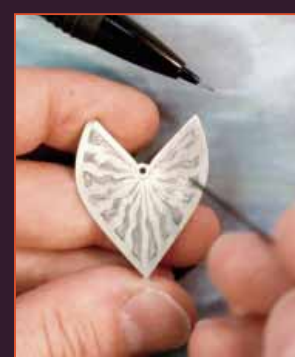
Marking out the cells for the enamel

Alternatively cloisonné wires are fired gently to a flux (clear colourless enamel) coated copper base and the piece finished in the usual cloisonné method. The copper base is then etched away leaving a fragile pattern of enamel and wire.