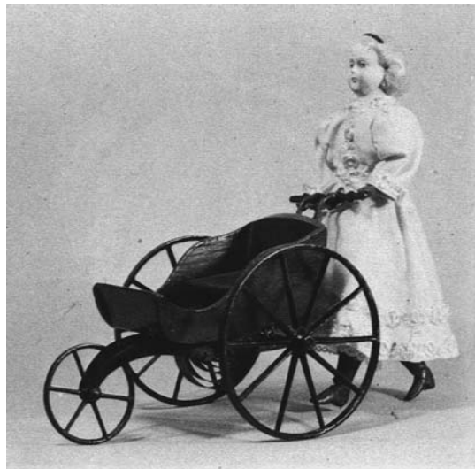
Walking doll with baby carriage, 1858.

The nineteenth and early twentieth century was the heyday for metal clockwork toys, small and large-scale. Seaside and pier attractions included mechanical 'haunted house' and 'ghost-train' attractions. After the First World War, plastic changed the face of toy manufacturing. Now we have robots capable of assembling robots so it's not surprising that the manifestations of an artist's imagination are as appealing as ever and perhaps the relative 'simplicity' of contemporary automata, plus the narrative element, makes the genre all the more appealing.