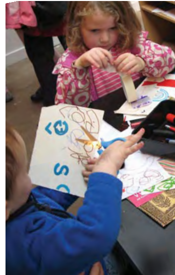
The Big Draw

www.crafts.org.uk for more details nearer the event.